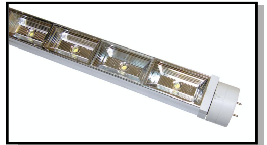
T12 Square Linear Lamp Tube